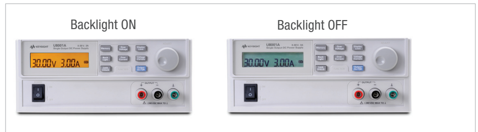
Figure 2. Backlight on/off options for LCD display