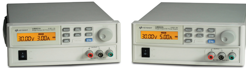
Figure 1. The U8001A 90 W and U8002A 150 W single output DC power supplies